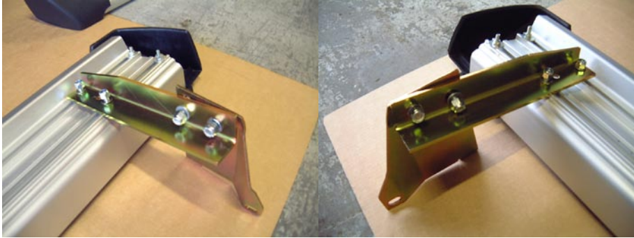
Bracket Configuration – (Left – Front Bracket : Right Rear Bracket) Left hand step shown