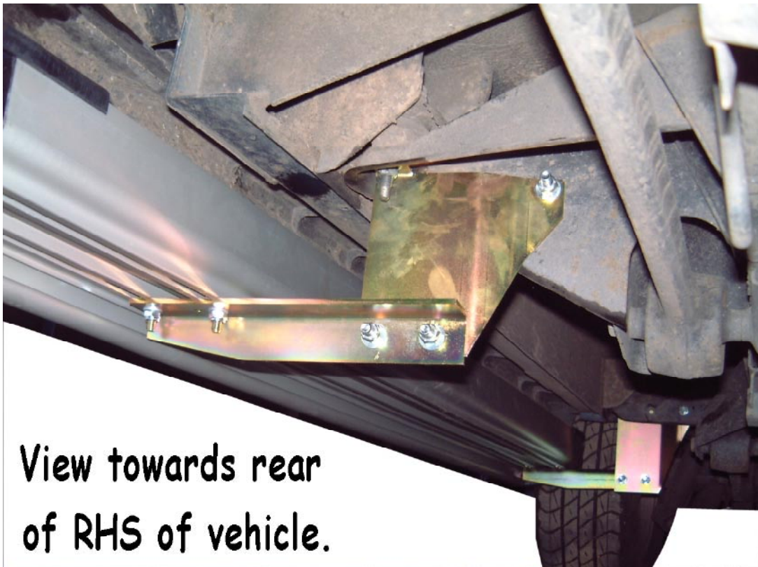
View towards rear of RHS of vehicle.