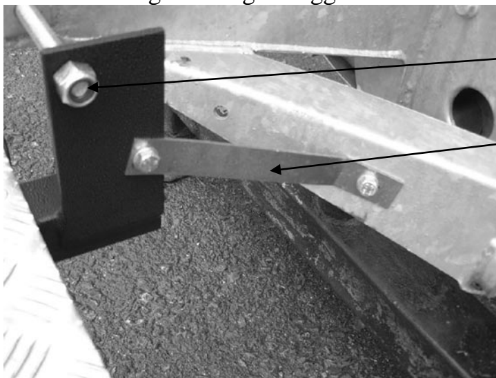
Rear Mounting showing outrigger